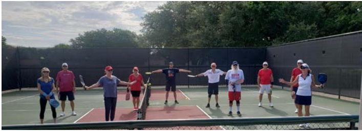
Independence Day Action on the Tennis and Pickleball courts – Social distancing, of course!