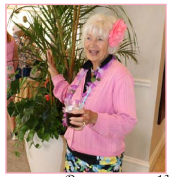
Dunescape page 13