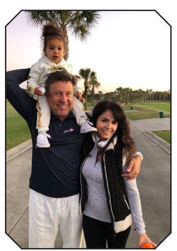
Dunescape page 14