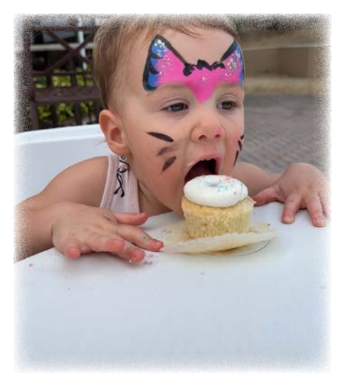
Dunescape page 24