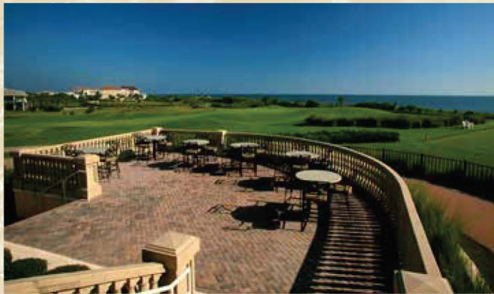
Tom Fazio Links Course with magnificent ocean views and a golf experience as only Fazio can create

HAMMOCK DUNES Club Always in an Oceanfront State of Mind