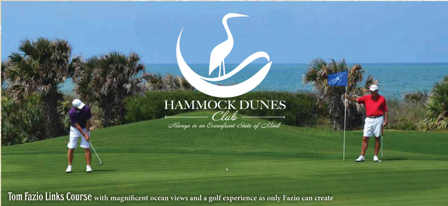
Tom Fazio Links Course with magnificent ocean views and a golf experience as only Fazio can create

HAMMOCK DUNES Club Always in an Oceanfront State of Mind